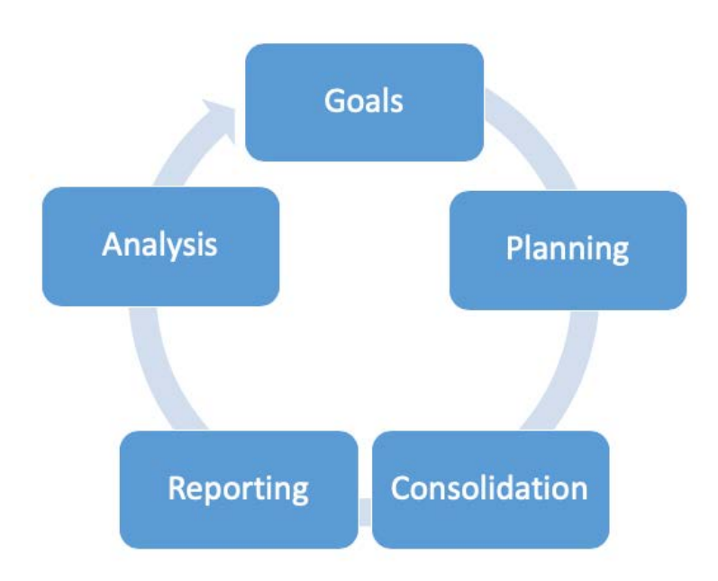
Figure 1. CPM Supports Management Processes

Transforming finance processes and modernizing finance systems are key initiatives for many organizations. These initiatives should include operational systems – such as ERP, CRM, HCM and Supply Chain – to support operational excellence. Moreover, the need for better, faster management decision-making is driving modernization of CPM applications. Modern CPM solutions support effective planning, consolidation, reporting and analytics across systems and departments – in one unified platform that supports faster and more confident decision-making. This approach is essential for driving management excellence in today's rapidly changing business environment.